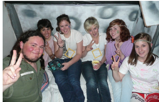
Sacajawea - Gateway to the Mountains Field trip